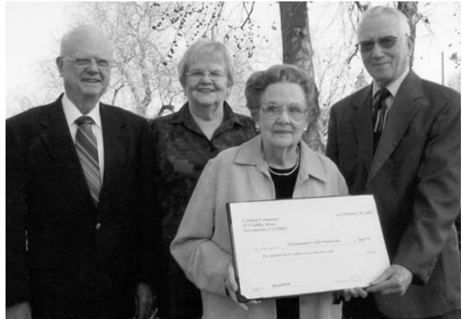
Thanks to the group from Campus Commons who gave a generous donation!